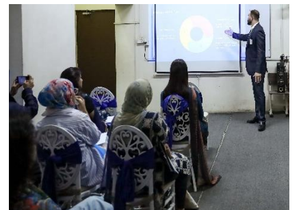
IU School System