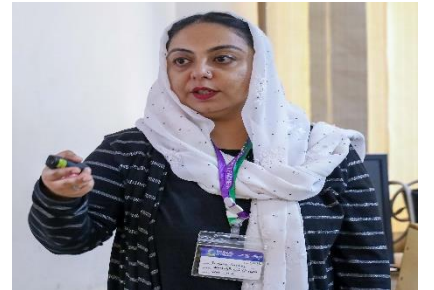
HHS School System