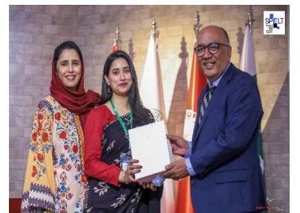
DHA Suffa University