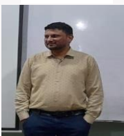
Associate Chair Membership