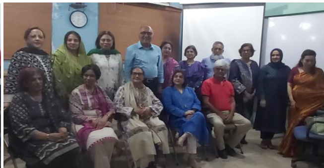
CEC members with Chairs Professional Councils and EC