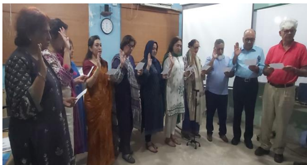
Oathtaking of the elected SPELT CEC, 2023