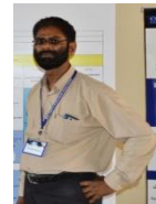
M.Yameen Journal support