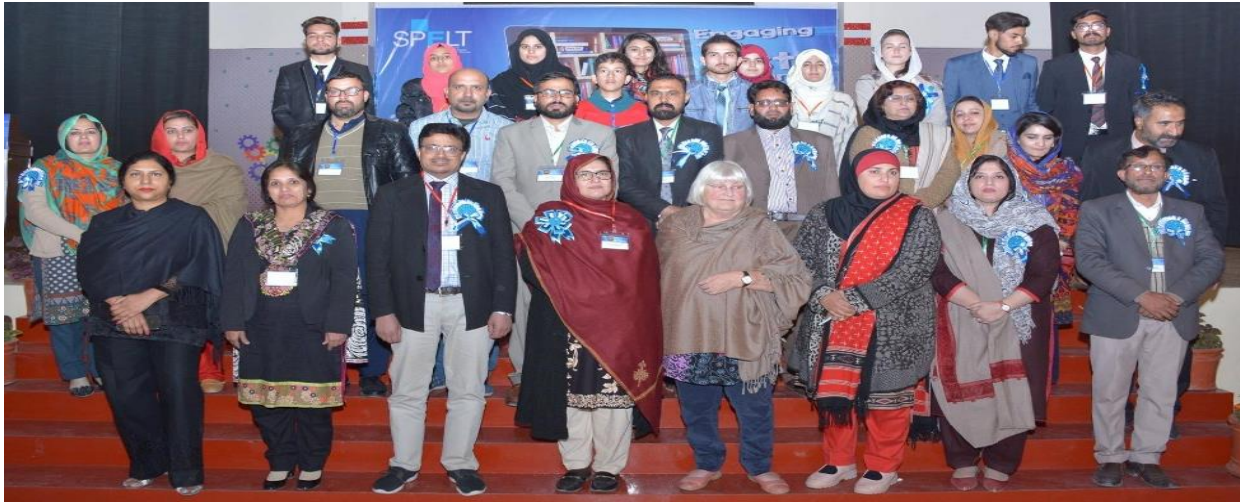
Group photo of presenters with working committee members, Abbottabad Chapter