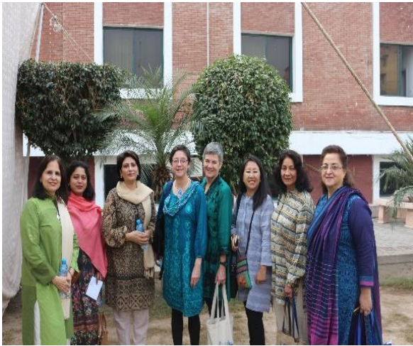
Conference Day 1, 10 Nov 2018